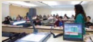
New Classrooms, Science and Art Labs