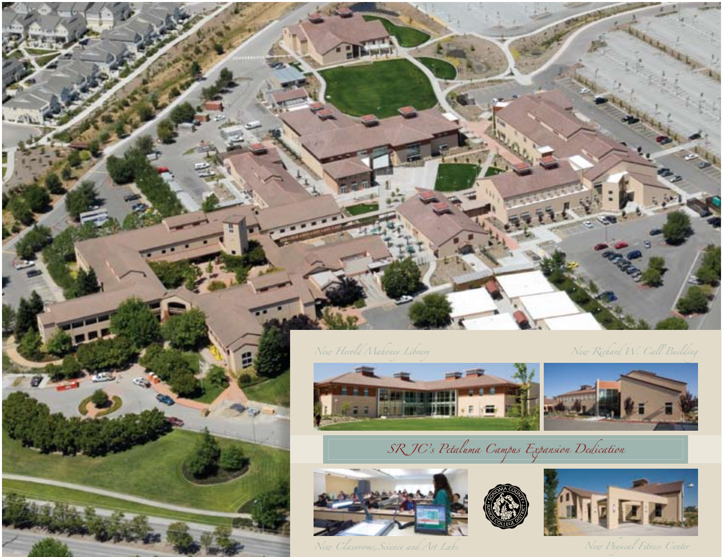
New Herold Mahoney Library