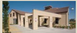
New Physical Fitness Center