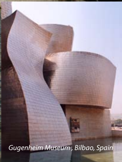
Guggenheim Museum, Bilbao, Spain