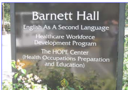
The HOPE Center is located in Barnett Hall 1282

One of the primary goals of the HOPE Center is to broaden the horizons of students regarding opportunities for careers in a variety of allied health programs. Secondly, we offer support to currently enrolled students of nursing and allied health programs. We also recruit and prepare high school students to explore healthcare careers and promote readiness for community college programs. The highlights of the center include: a 12 station computer lab, free tutoring sessions, health