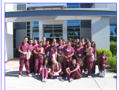
Summer Health Careers Institute Class of 2010