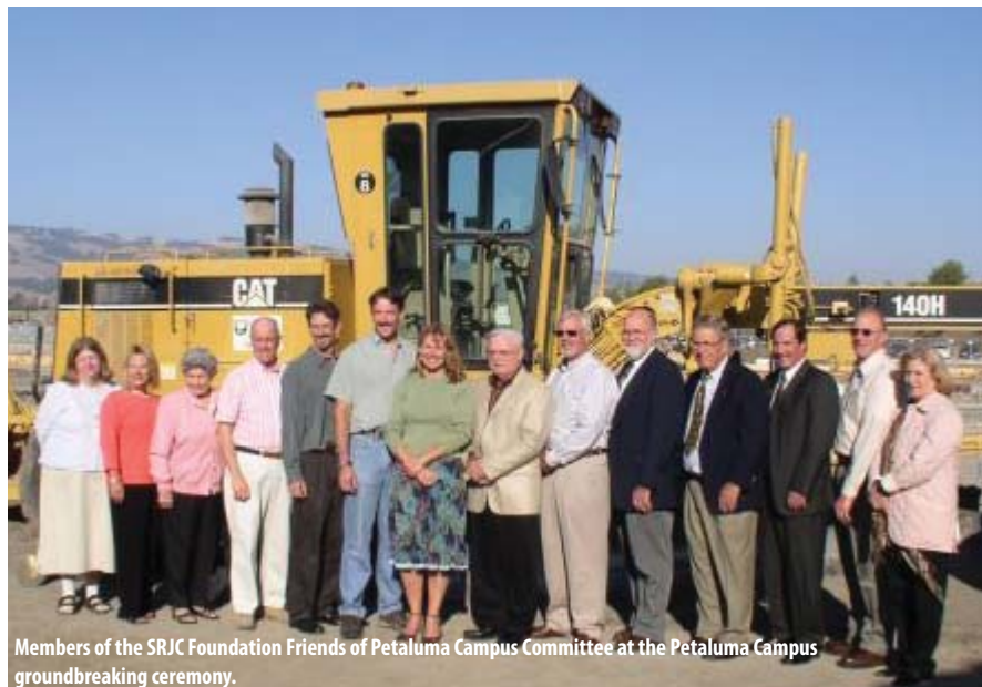
Members of the SRJC Foundation Friends of Petaluma Campus Committee at the Petaluma Campus groundbreaking ceremony.

may make a planned gift or multiyear pledge to name a room or outdoor space on the campus. Your name or the name of a loved one will remain forever as a legacy of your support for SRJC's Petaluma Campus. Donors of $1,000 or more will be acknowledged on the Donor Wall of Honor.