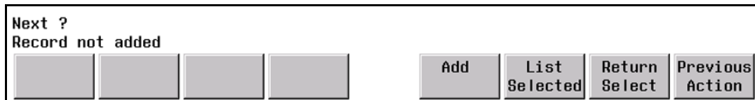
Figure 16.6 At next event

Speedware® uses the ‘at next’ event to interrupt the processing of a set of records and to ask the user what to do. These are typical ‘at next’ function keys: